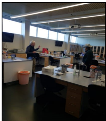
Annual Convention 2018

November 2 - Conference Registration 9:30