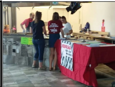
2018 State Fair Tasting

Website: https://nebraskasheepandgoat.org/